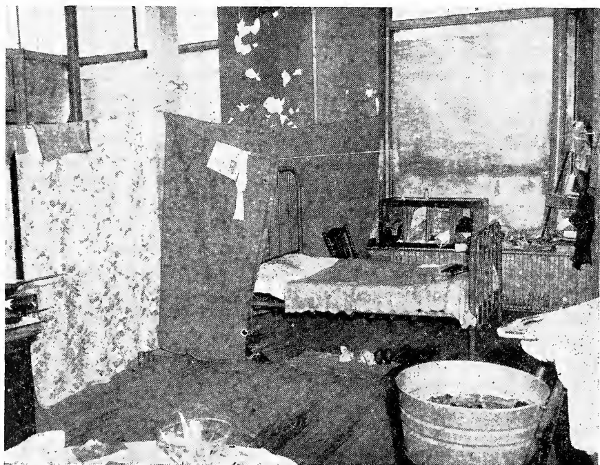
In the foreground is the portable zinc washtub used by this storefront lessee in the earning of her livelihood as a laundress.